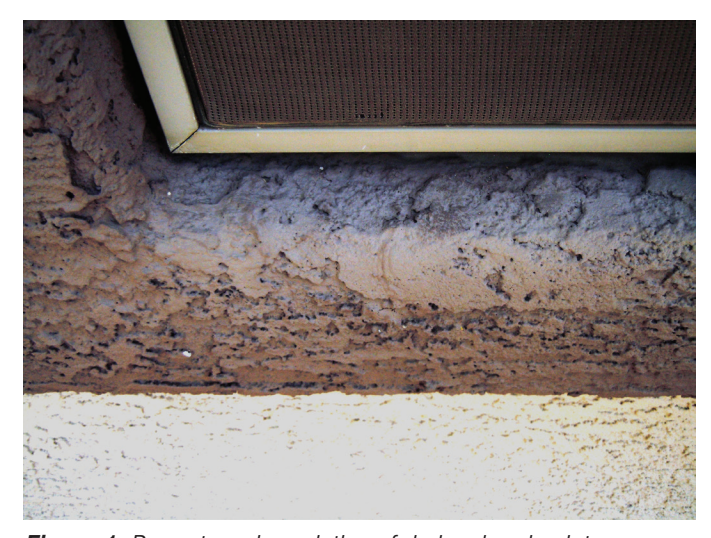
Figure 1: Premature degradation of dark colored paint on horizontal surface.

Darker colors will absorb more heat and energy than lighter colors, which may lead to faster degradation of the binder and paint film. The binder degradation may be perceived as discoloration and/or even loss of gloss (Figure 1). Lighter colors will reflect more light and harmful UV rays, and do not absorb as much heat and energy. This could potentially lead to an improvement in film durability, but is also dependent on the type of pigments used, based on the color selection. When choosing a color, a good indicator of how well a color reflects light is to look at its Light Reflectance Value or LRV. Higher values (closer to 100) indicate colors that reflect more light and will remain cooler when exposed to sunlight.