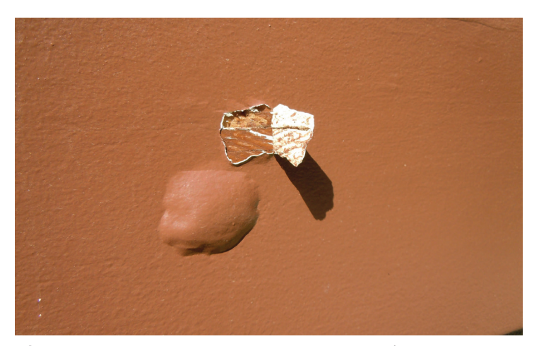
Figure 2: Blistering down to previous coatings and/or substrate.

While blisters can appear on many types of coatings in both light and dark colors, the rate and extent of blistering may be more prevalent in dark colors. Dark colors will absorb more heat than lighter colors and will therefore put more stress on the existing paint system, due to greater expansion and contraction of the paint film and even the substrate. Painted surfaces that receive direct sun will be placed under the greatest stress. Applying a dark colored paint over an existing paint system that is in poor condition could also result in blistering, typically down to the previous coating or to the substrate (Figure 2).